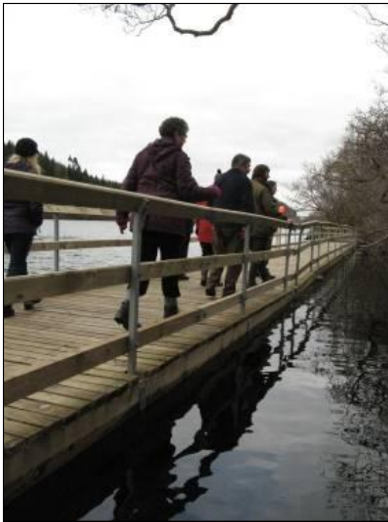
Beaver Spring walk, Knapdale 19/3/11

On the 19 th and 20 th March SBT staff and volunteers participated in the European wide ' Beaver Spring ' event ("Printemps des Castors") in which beaver celebration activities take place across France, Germany, Switzerland, Belgium, Holland, Luxembourg and Scotland. At Knapdale the weekend saw a beaver training event for local volunteers held by Polly Phillpot and Amy Cox, our RZSS Education Officers, and this was followed later that night and the following morning by three guided walks from the Barnluasgan Information Centre down to the Dubh Loch site. The same weekend saw fun beaver activities at the Kelvingrove Museum in Glasgow, with over 300 museum visitors taking part in our beaver quiz trail around the impressive halls of this very busy attraction.