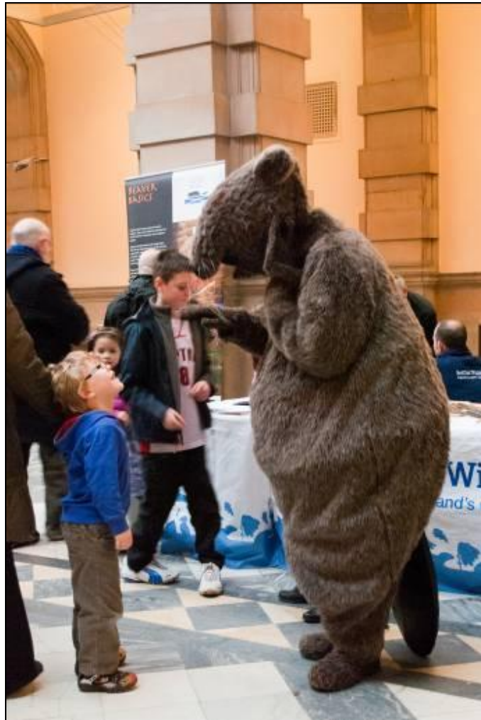
Bruce the Beaver meeting visitors at Kelvingrove Museum, Glasgow 19/3/11