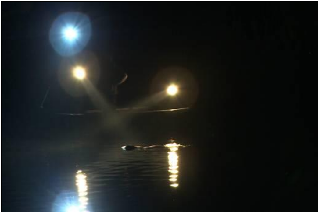
Field Officers night tracking beavers in Knapdale