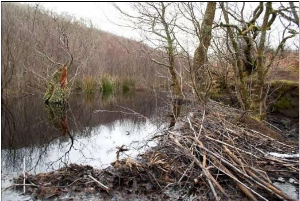
Dubh Loch beaver dam, March 2011